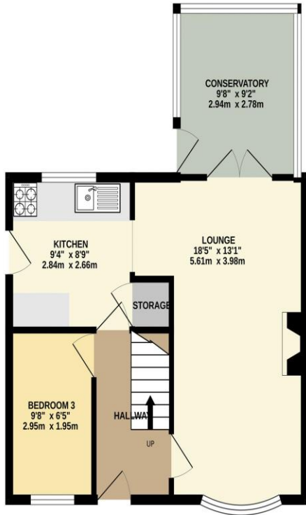
GROUND FLOOR 497 sq.ft. (46.2 sq.m.) approx.